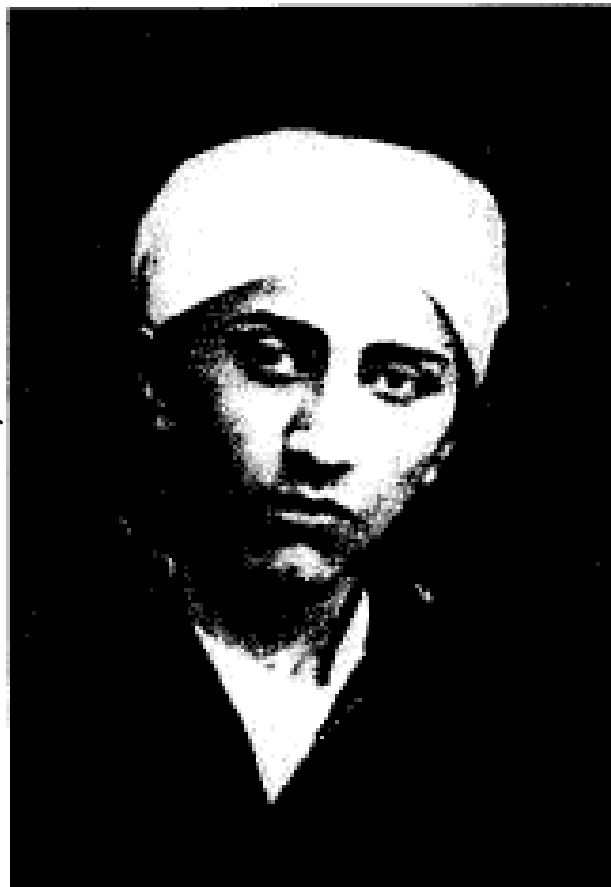
Mírzá Mihdí, The Purest Branch

Many of Bahá'u'lláh's family and friends stayed with Him in these terrible conditions. They loved Him so much that they would rather be with Him in prison than apart from Him in freedom and comfort. Just being with Him was being in Paradise.